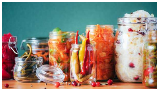
Figure 4. Packed canned foods.

Fermentation is the anaerobic conversion of carbohydrates to alcohols, carbon dioxide, or organic acids in food processing utilizing yeasts, bacteria, or a combination of both. Fermentation is a metabolic process that converts sugar to acids, gases, and/or alcohol. It's found in yeast, bacteria, and oxygen-depleted muscle cells, as well as in lactic acid fermentation. The term "fermentation" [16] is also used to describe the rapid growth of microorganisms on a growth medium. Fermentation is also employed in bread leavening, the preservation of sour foods like sauerkraut, dry sausages, kimchi, and yogurt, and the vinegar pickling of goods.