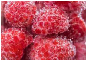
Figure 8. Freeze meat.

Freezing and Refrigeration Cause Chemical Changes. The development of rancid oxidative tastes in frozen food is a chemical alteration that can occur when the frozen product comes into contact with air. This issue can be avoided by utilizing a wrapping material that prevents air from entering the package. To decrease the quantity of air in contact with the goods, it's also a good idea to remove as much air as possible from the freezer bag or container.