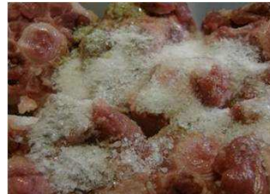
Figure 5. Salted Foodstuff.

from the food's body cells to the outside of the body, a process called osmosis. It reduces the amount of water in the diet. The overall water activity of the food product is reduced when the water content of the food product is reduced. It inhibits a wide range of biochemical and enzymatic reactions, as well as microbiological growth. The food product will not spoil as a result of this.