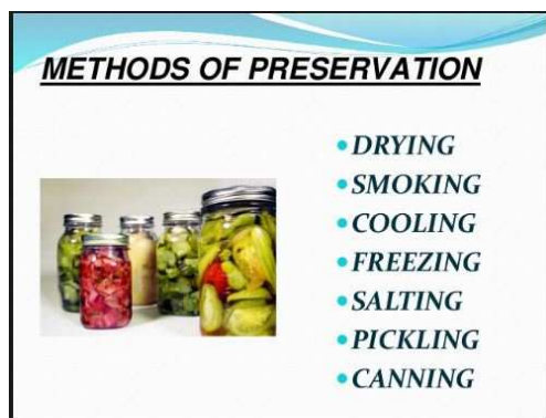
Figure 1. Traditional/Conventional Food Preservation Techniques.

One of the most important causes driving food spoiling is enzymatic processes such as nonenzymic browning or Maillard reactions. These responses are greatly influenced by water activity, with rates peaking around 0.6 to 0.7. The color change is caused by the browning of milk powder maintained at 40°C for 10 days, which results in the loss of lysine. At low humidity levels, browning processes are usually slow.