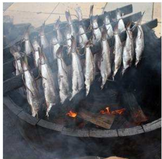
Figure 2. Smoking process of meat to remove moisture.

It is possible to combine curing with smoking. Smoke dehydrates the meat and covers it with a variety of compounds, including minor levels of formaldehyde. In food processing, smoking refers to the practice of exposing cured meat and fish products to smoke to preserve them and improve their palatability by enhancing flavor and giving them a rich brown color. Although many of the compounds included in wood smoke are natural preservatives, the aeration action of the smoke tends to preserve the meat.