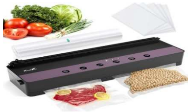
Figure 9. Vacuum Packed food items.

most commonly utilized in retail packaging. The original air atmosphere is removed, and the atmosphere that emerges during storage is primarily the consequence of the products' biological activities.