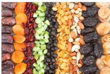
Figure 7. Dry Fruits and nuts.

The drying principle is based on water activity: the lower the water activity, the longer the food product's shelf life. Dehydration lowers the water content of food, lowering water activity and extending shelf life.