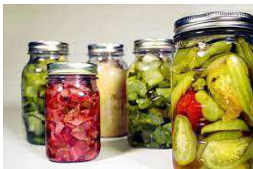
Figure 3. Packed pickling foods.

Pickling is a great way to keep perishable goods fresh for months. Herbs and spices with antimicrobial properties, such as mustard seed, garlic, cinnamon, and cloves, are frequently used. If there is enough moisture in the food, a pickling brine can be made simply by adding dry salt.