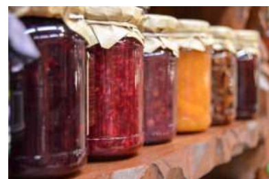
Figure 6. Packed Sugared foods.

Sugar is still used as a preservative in the preservation of certain goods. The main mechanism of action is that high sugar content causes hypertonicity in foodstuffs, and bacteria cannot survive in hypertonic solutions because the hypertonic solution draws water from the bacterium, causing it to become dehydrated. Fruits are frequently stored in honey or sugar. Sugaring can also be found in jams and jellies. This technique is also used in the preparation of certain soft drink concentrates, such as orange squash, which has high sugar content.